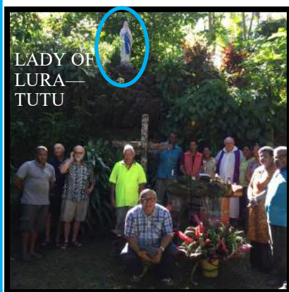
LADY OF LURA—TUTU

Good wishes for a happy and holy Easter to all confreres and your communities. To all our benefactors and friends, a blessed Holy Week and a jubilant Easter!!